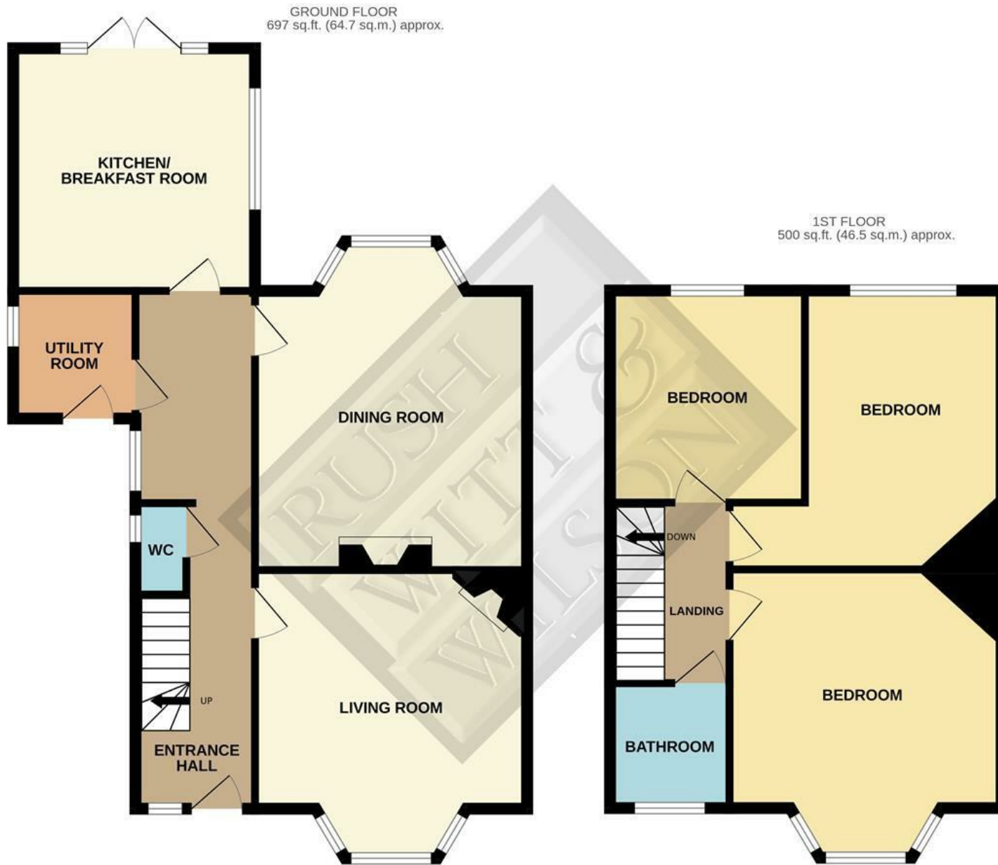
GROUND FLOOR 697 sq.ft. (64.7 sq.m.) approx.